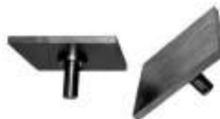
Compression Plates Square - Rectangular - Circular