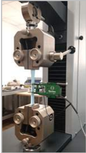
Extensometers Small Elongations