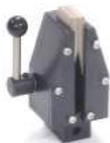
Manual Grips (Film - Fabrics - Sheets...)