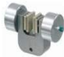
Pneumatic Grips (Film - Fabrics - Sheets...)