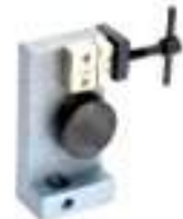
Bollard type Grips (Threads - Ropes - Wires Fine Ductile Cables ...)