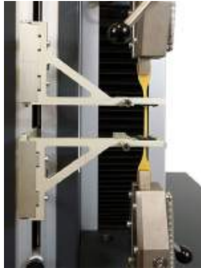
Extensometers High Elongations