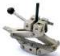
Self-clamping Grips (Elastomers - Rubber...)