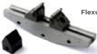
Flexure / Bending Fixtures